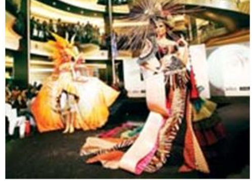
Fig.4 (fantasia fashion)